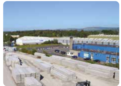
Our Head Office, manufacturing plant and stock yard are situated in Omagh, Co. Tyrone, Northern Ireland with a further holding yard in the UK to allow effective service to our UK based clients.